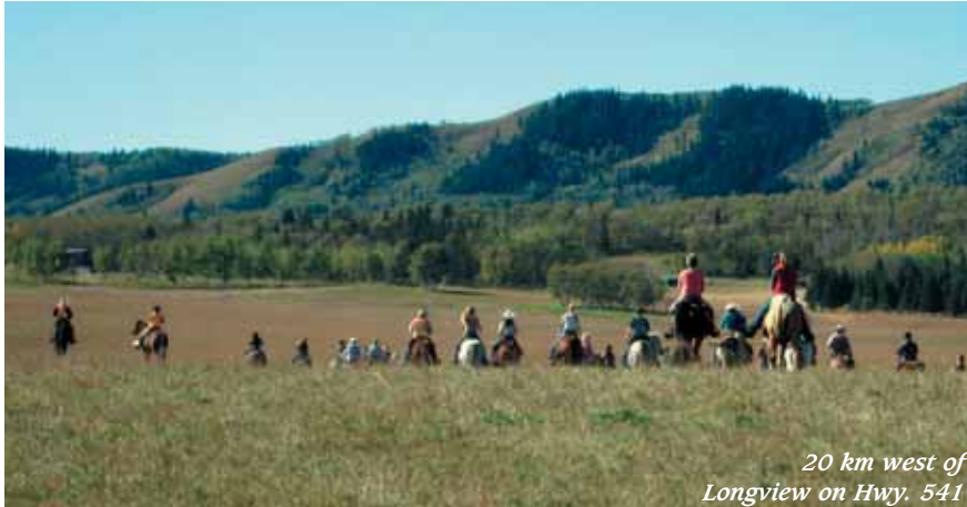
20 km west of Longview on Hwy. 541